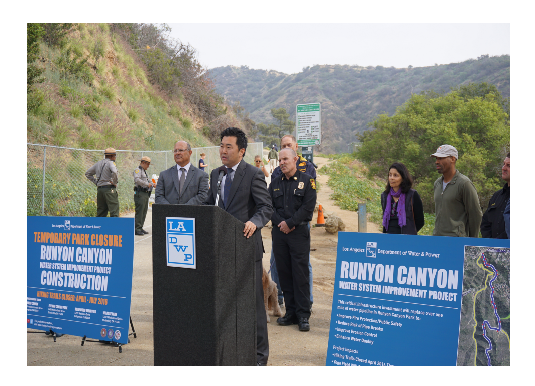
For more information, click here .